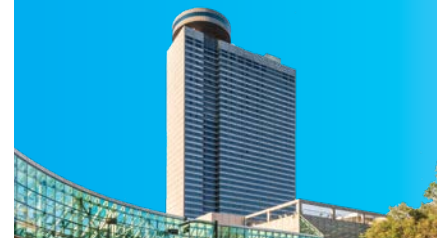
Sheraton Kansas City