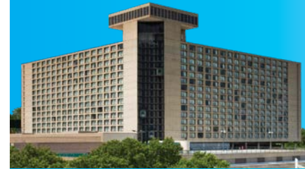
The Westin Kansas City